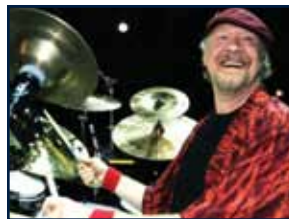
Doane Perry Jethro Tull Ian Anderson