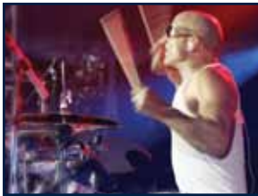
Kenny Aronoff John Mellencamp Smashing Pumpkins