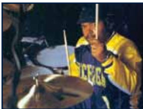
Dennis Chambers Santana